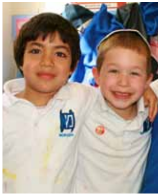
Above: Pupils of Morasha

Following a lengthy process involving market research within the local community as well as a series of public meetings, Morasha opened in September 2008 with seven pupils and by September 2013 is expected to have grown to more than 145 children.