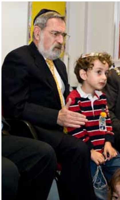
Above: Chief Rabbi Lord Sacks with pupils at Morasha

The governors and trustees of the school are delighted to associate the school with the Chief Rabbi, who has done so much for the development and expansion of